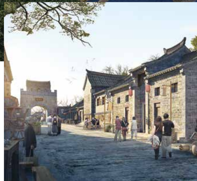
项目地点：河南省禹州市神垕镇 Project location: Shenhou Town, Yuzhou City, Henan Province

禹州市神垕古镇老街 Traditional Street, Ancient Shenhou Town, Yuzhou