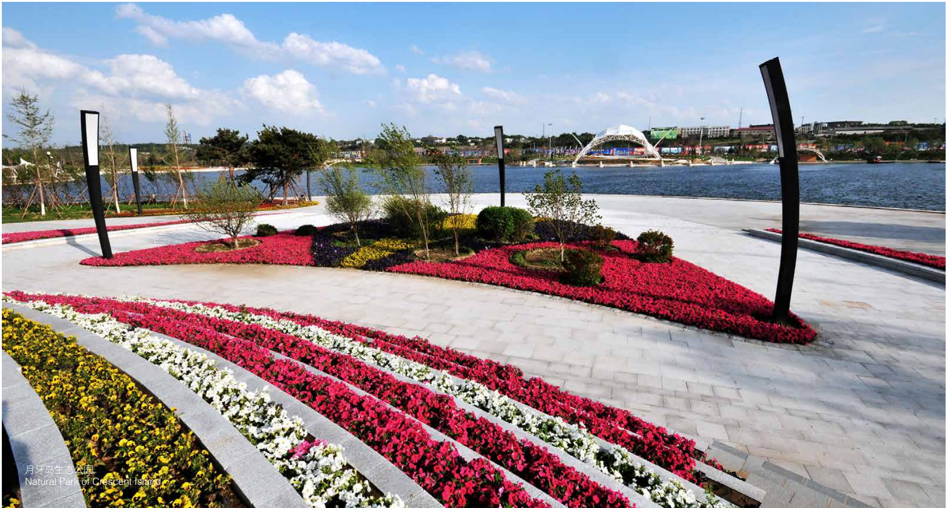
月牙岛生态公园 Natural Park of Crescent Island