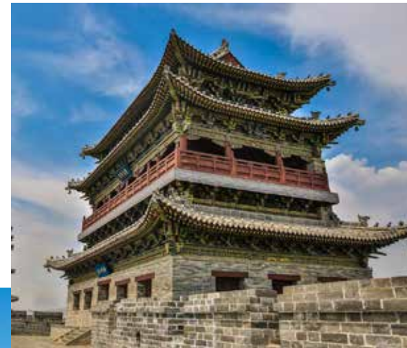
项目地点：山西省大同市明代城墙旧址 Project location: Ming Dynasty city wall in Datong, Shanxi

项目规模：328 万平方米 Project Scale: 3,280,000M 2